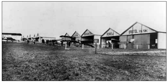
LARKHILL The original British & Colonial sheds are to the right of this photograph separated from the military sheds by the 'sun gap'.