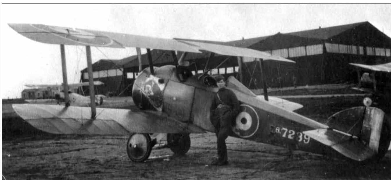
B7239 of 56 TDS at Cranwell conformed more closely to the original conversion but had only a single pitot head.