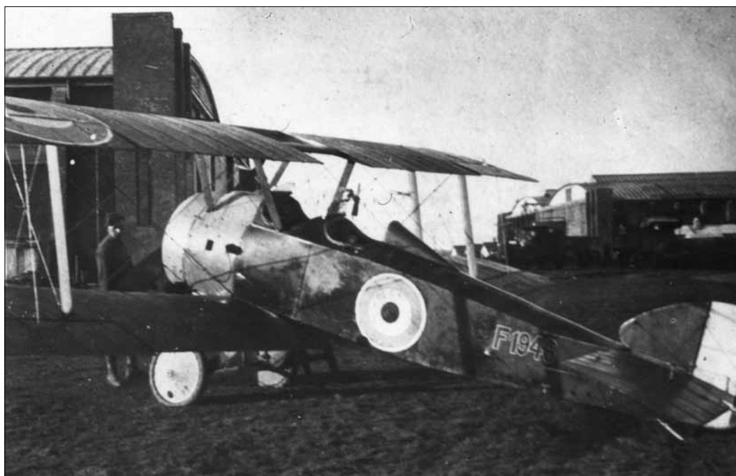
F1946 of 5 TS AFC is shown under erection or repair in the header photograph. That at the right shows it fully assembled and reveals that, as with such machines converted at Montrose, its induction pipe was not raised. F1946, a converted Boulton & Paul machine, had enlarged cut-outs in its centre-section.