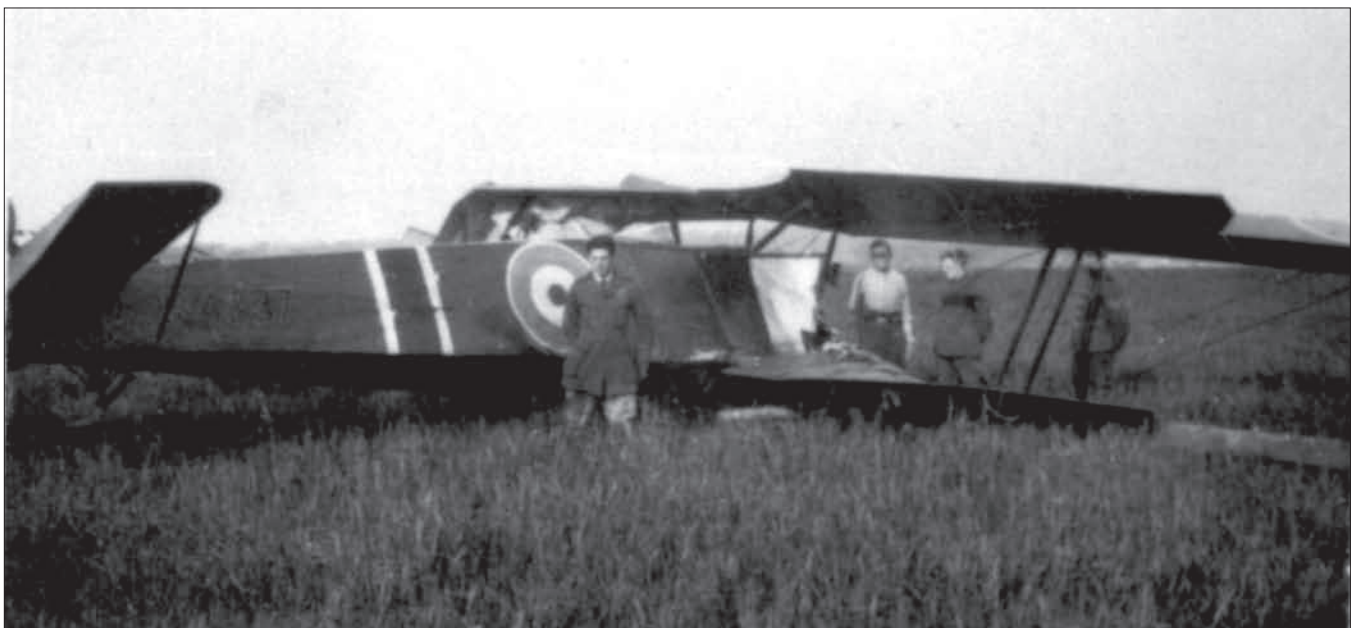
Avro 504J B4237 was one of a batch of 150 built by the parent company (a mixture of As and Js) and was photographed after coming to grief on its aerodrome